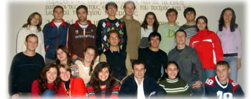
Eastern Europe Bible College students.