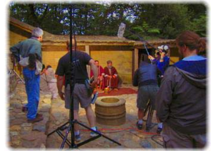
IMM crew shooting BSVP footage on location.